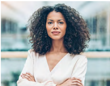
The Entrepreneurial Mindset