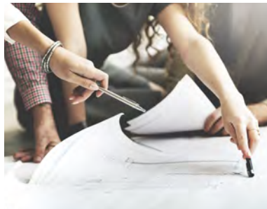
Building Your Business Blueprint