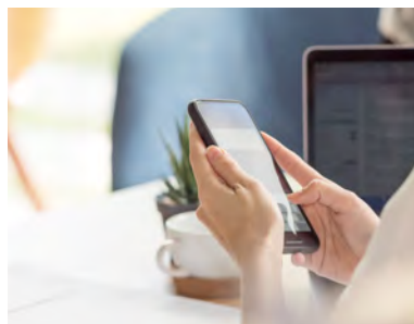
The Business of Social Media