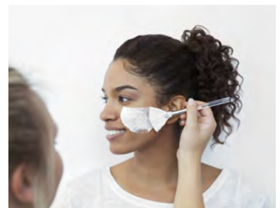
And so much more!