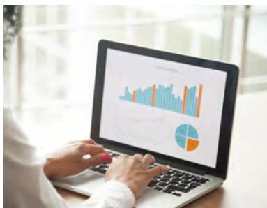
The Business of Marketing